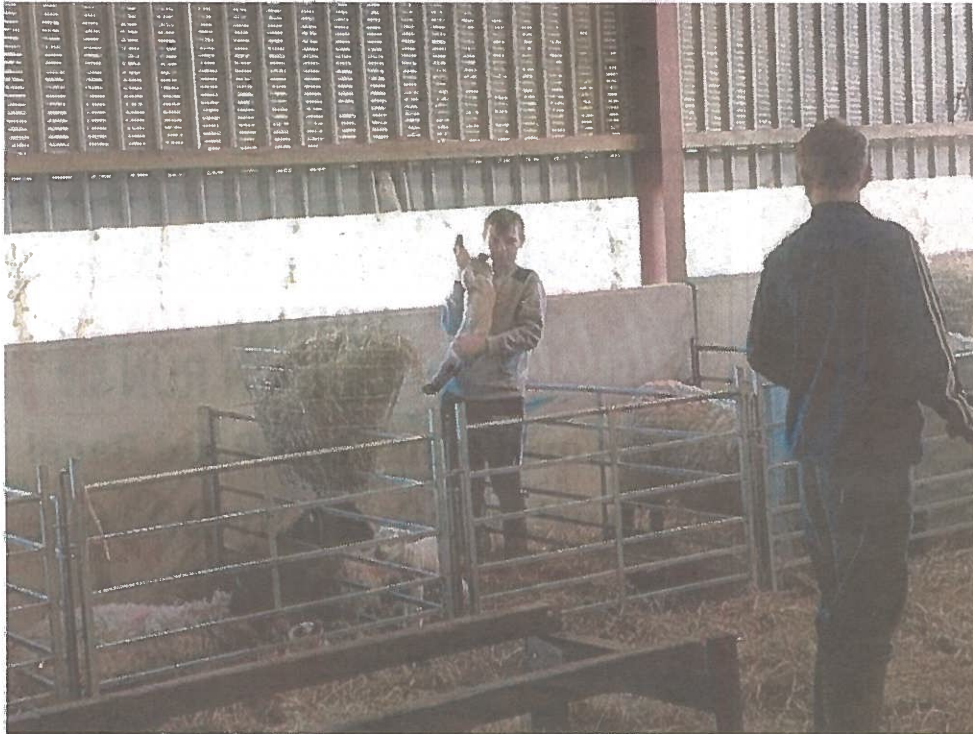
A NEW EWE... pupils discovered a new side to themselves during the trip.